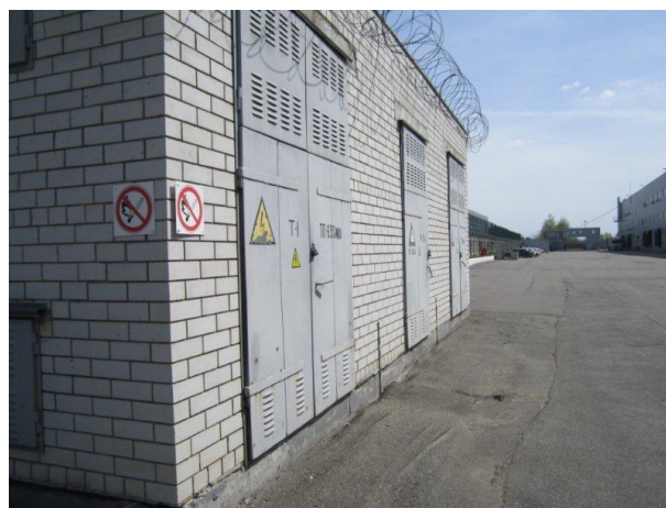
Photo No.4. Transformer substation