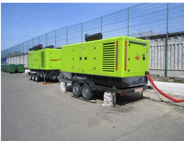
Photo No.3. Diesel-generators of reserve capacity