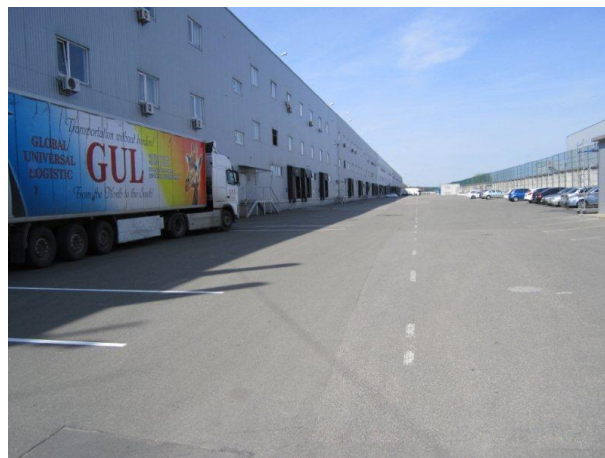
Photo No.2. General view on the complex area