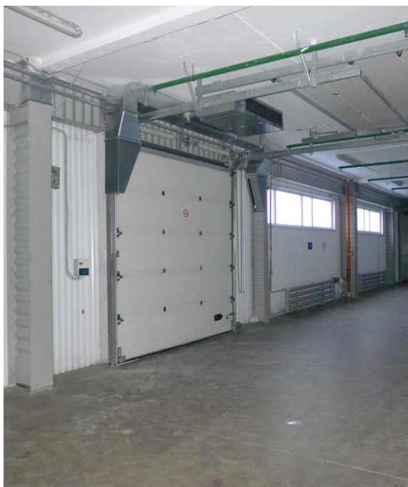
Photo No.7. Interior lobby, box No.8