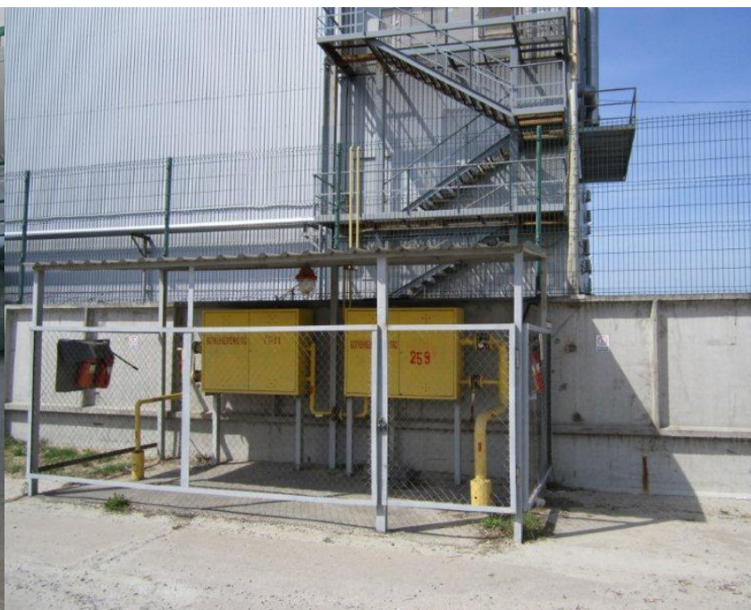
Photo No.8. Gas-distributing plant