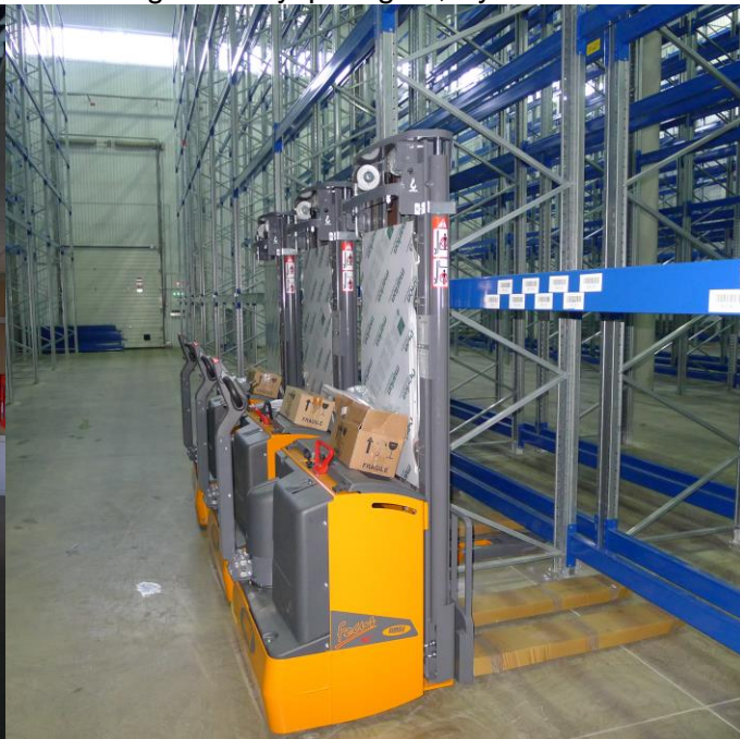
Photo No.6. General view of a warehouse premise (inside view of the box No.8)