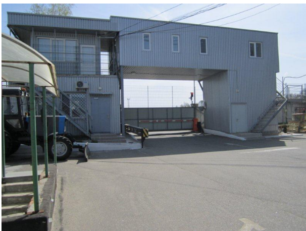
Photo No.1. Checkpoint No.1. View from the territory inside

Logistic complex at the address of Velyka Oleksansrivka village of Boryspil region, Kyiv oblast.