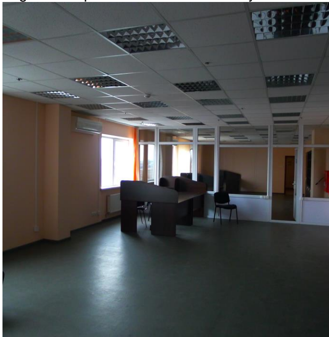
Photo No.5. General view on the office mezzanine – technical condition of premises leasable

Logistic complex at the address of Velyka Oleksansrivka village of Boryspil region, Kyiv oblast.